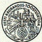
Estonian Chamber of Commerce and Industry