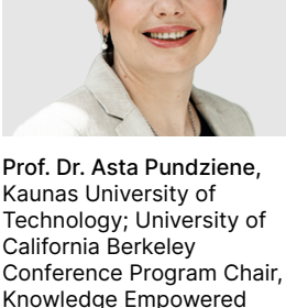
Entrepreneurship Network (KEEN) Leader Keynote: The EDIH Network as an Enabler for Figital Transformation of Business

9:00 - 13:00 & 14:45 - 20:00 EEST Time zone